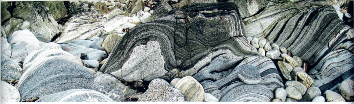
Helen Douglas, Lewisian II phase section, hand scroll, 30cm x 4 metres, edition of 4.