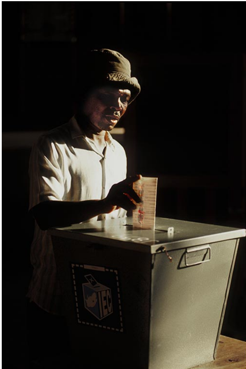
Katlehong , 1994, archival digital print, edition of 9 (3 remaining) image size 52 x 34cm.

We are thrilled that Graeme Williams's exceptional and notably poignant photograph Katlehong 1994, has entered the permanent collection of Le Musée Nationale d'Art Moderne , Centre Pompidou, Paris.